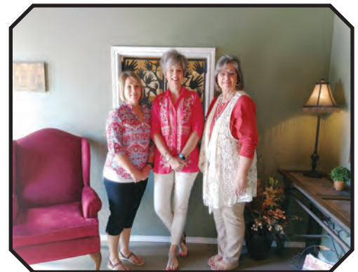
Pregnancy Resource Center of the Northern Big Country