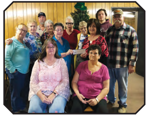
Hawley Senior Citizens Center

Big Country Electric Cooperative is proud to offer this program to share the cooperative spirit with our communities!