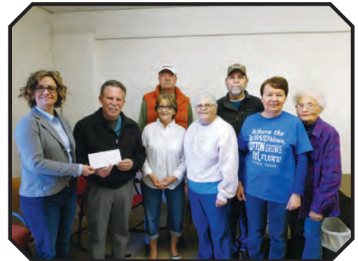
Snyder Shares Free Store