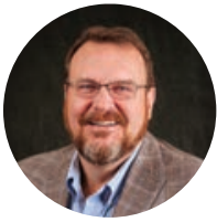
MESSAGE FROM GENERAL MANAGER/ CEO